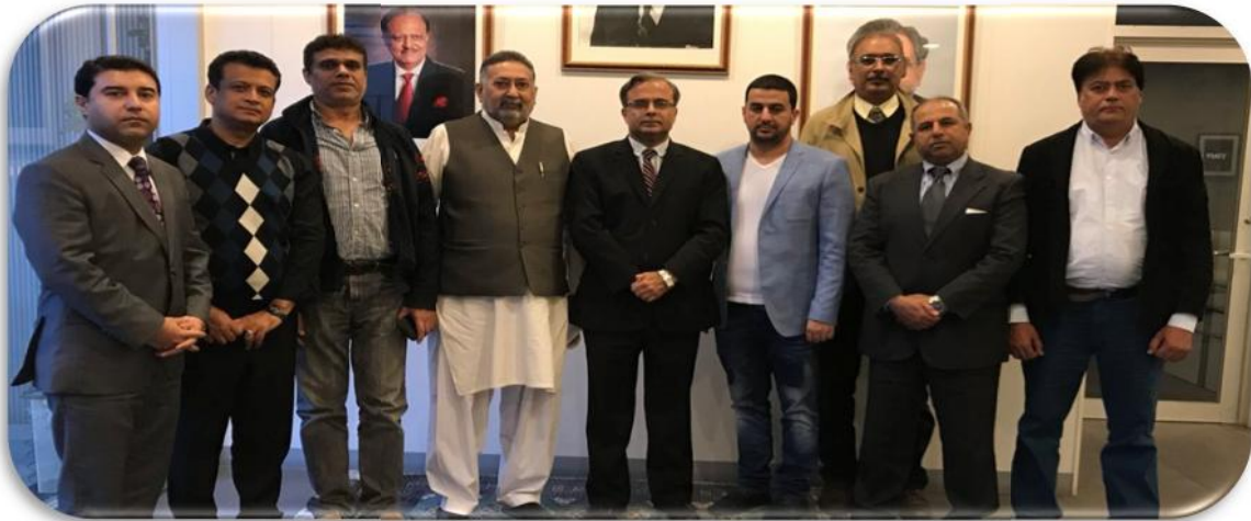
Members of the Pakistani Business Community called on the Ambassador at Pakistan Embassy