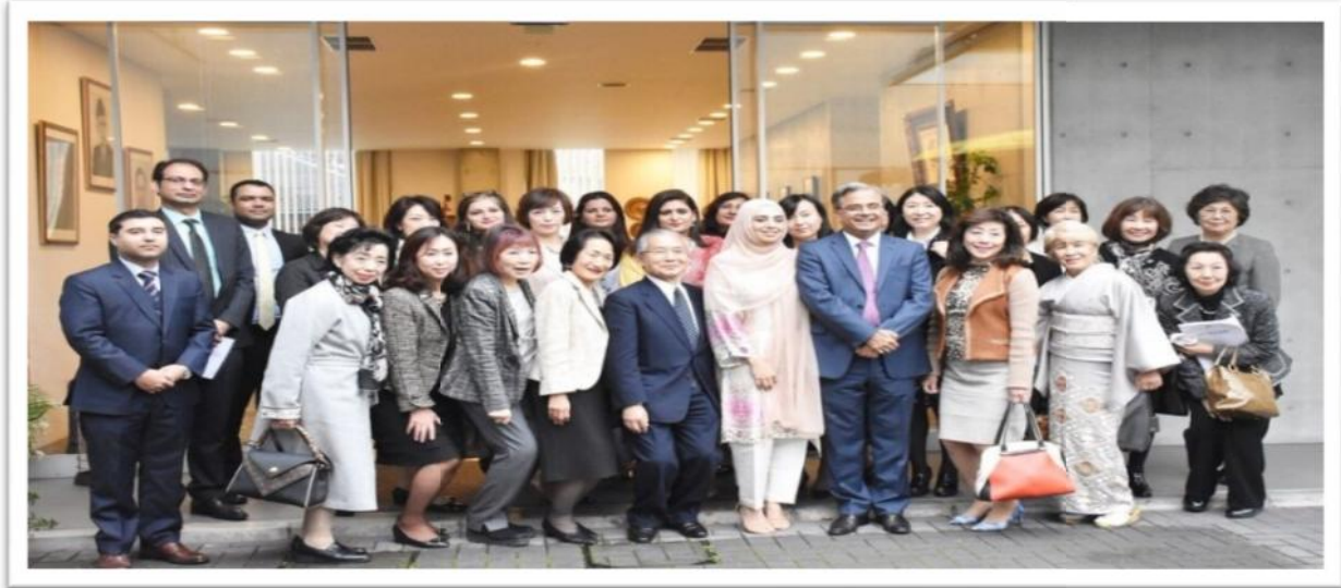
Received International Friendship Exchange Council delegation at the Embassy, given a comprehensive presentation on Pakistan